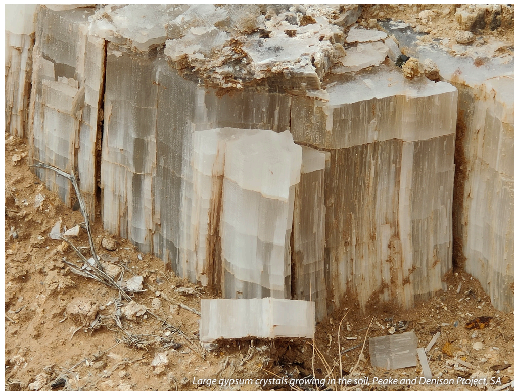
Large gypsum crystals growing in the soil, Peake and Denison Project, SA

No other significant changes occurred during the year.