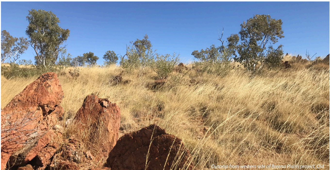
Outcrop from western side of Breena Plains project, QLD