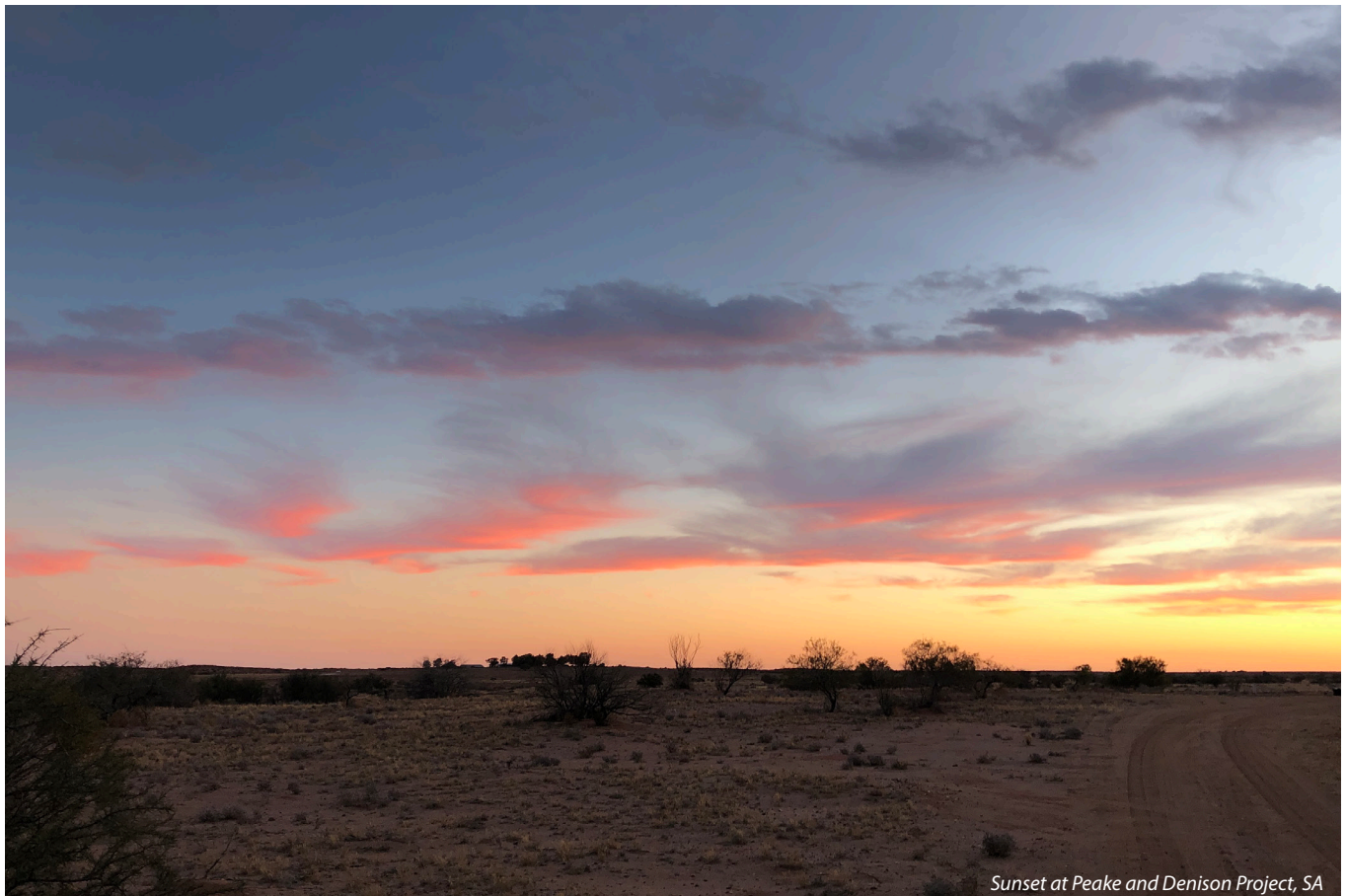
Sunset at Peake and Denison Project, SA

Minotaur last raised new capital in August 2020 and deployed that cash diligently during the FY2021 year, retaining $5.1 million at 30 June 2021.