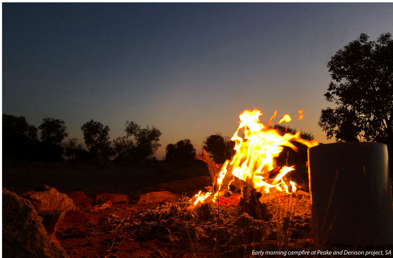
Early morning campfire at Peake and Denison project, SA