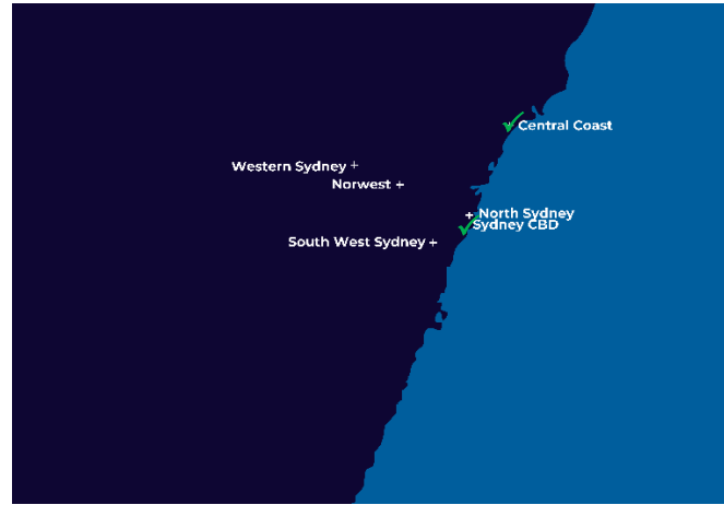
NSW Target Tuck-in Locations: 6 (completed: 2)