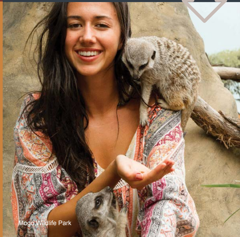
Mogo Wildlife Park

Through our collaboration with Solar Bay and Momentum Energy we will deliver a combination of on-site and off-site renewables that will meet 100% of the energy needs at the Waverley Gardens Shopping Centre, making it one of Australia's first totally renewable-powered shopping centres. This model will be implemented across a number of other assets in the Group's retail portfolio including Tweed Mall, Neeta City, Riverside Plaza, Gladstone Square and Hunters Plaza.