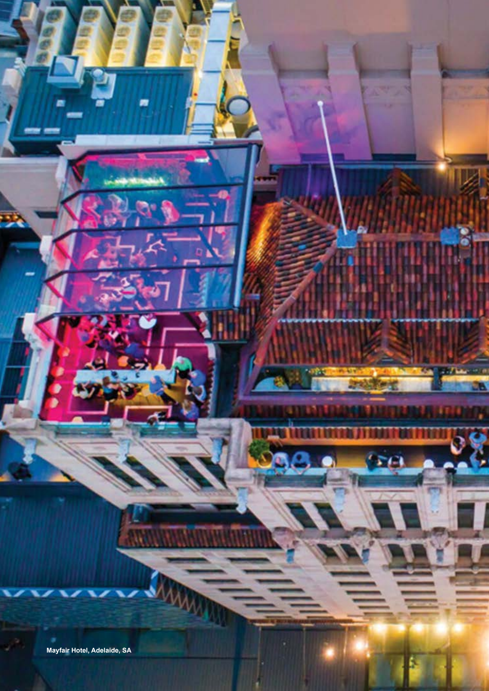
Mayfair Hotel, Adelaide, SA