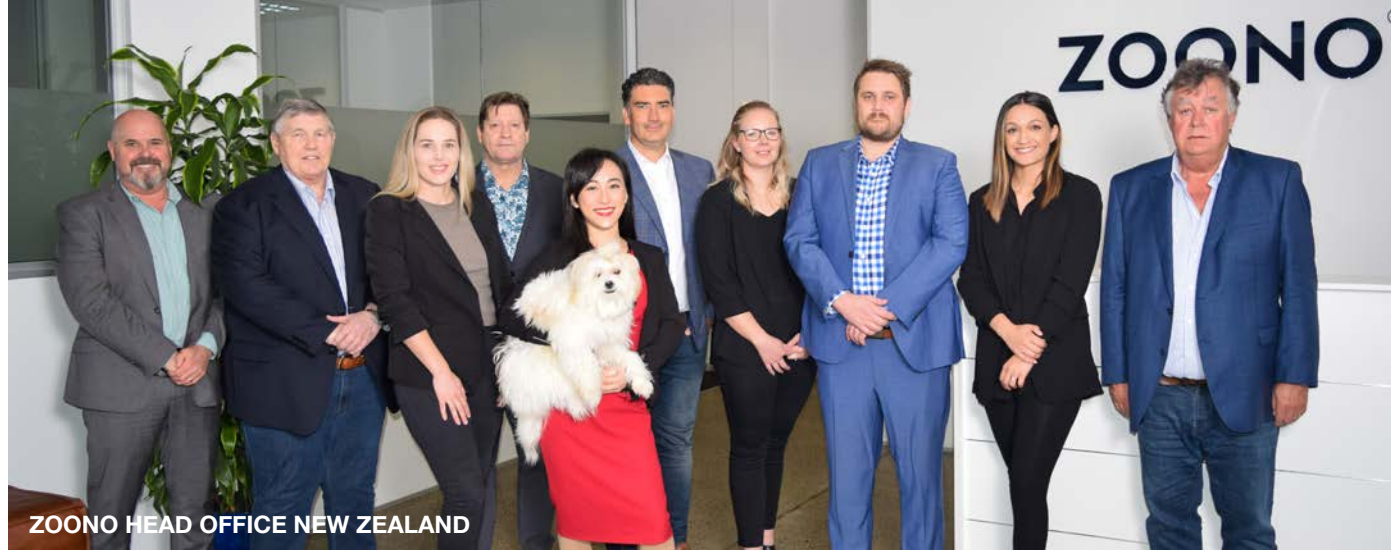
ZOONO HEAD OFFICE NEW ZEALAND