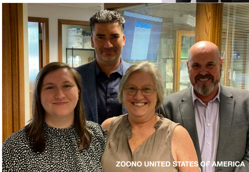
ZOONO UNITED STATES OF AMERICA