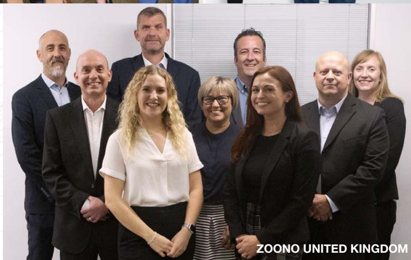
ZOONO UNITED KINGDOM