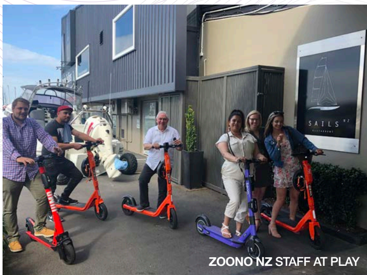
ZOONO NZ STAFF AT PLAY