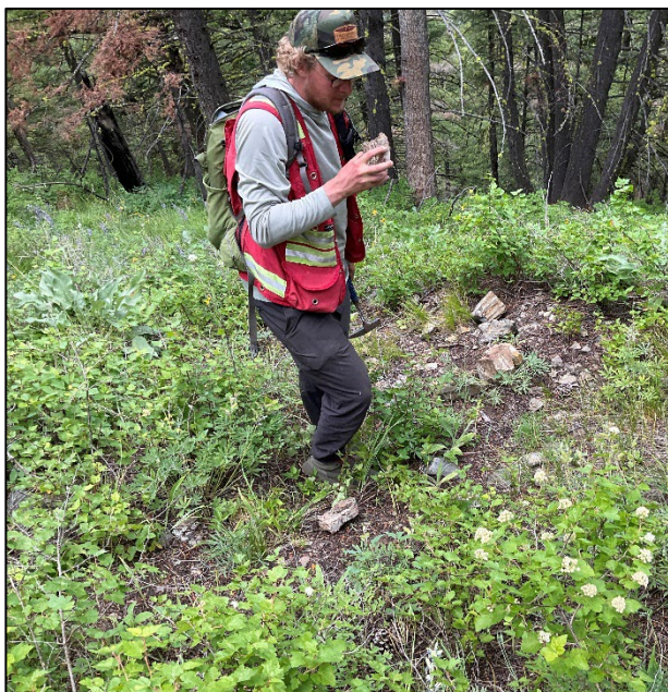
Team Inspecting Quartz Float at Anderson Creek

During the mapping program the team identified previously unmapped historical workings. The new workings have been sampled and will add new information to the geological modelling.