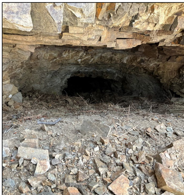
Historical Adit following a highly altered near parallel quartz vein. The highly altered white quartz vein was directly adjacent to the shear zone