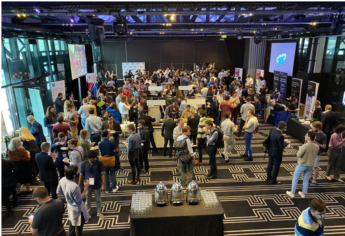
Image 2. Archer attends the Quantum Australia conference held in Sydney, in February 2022.