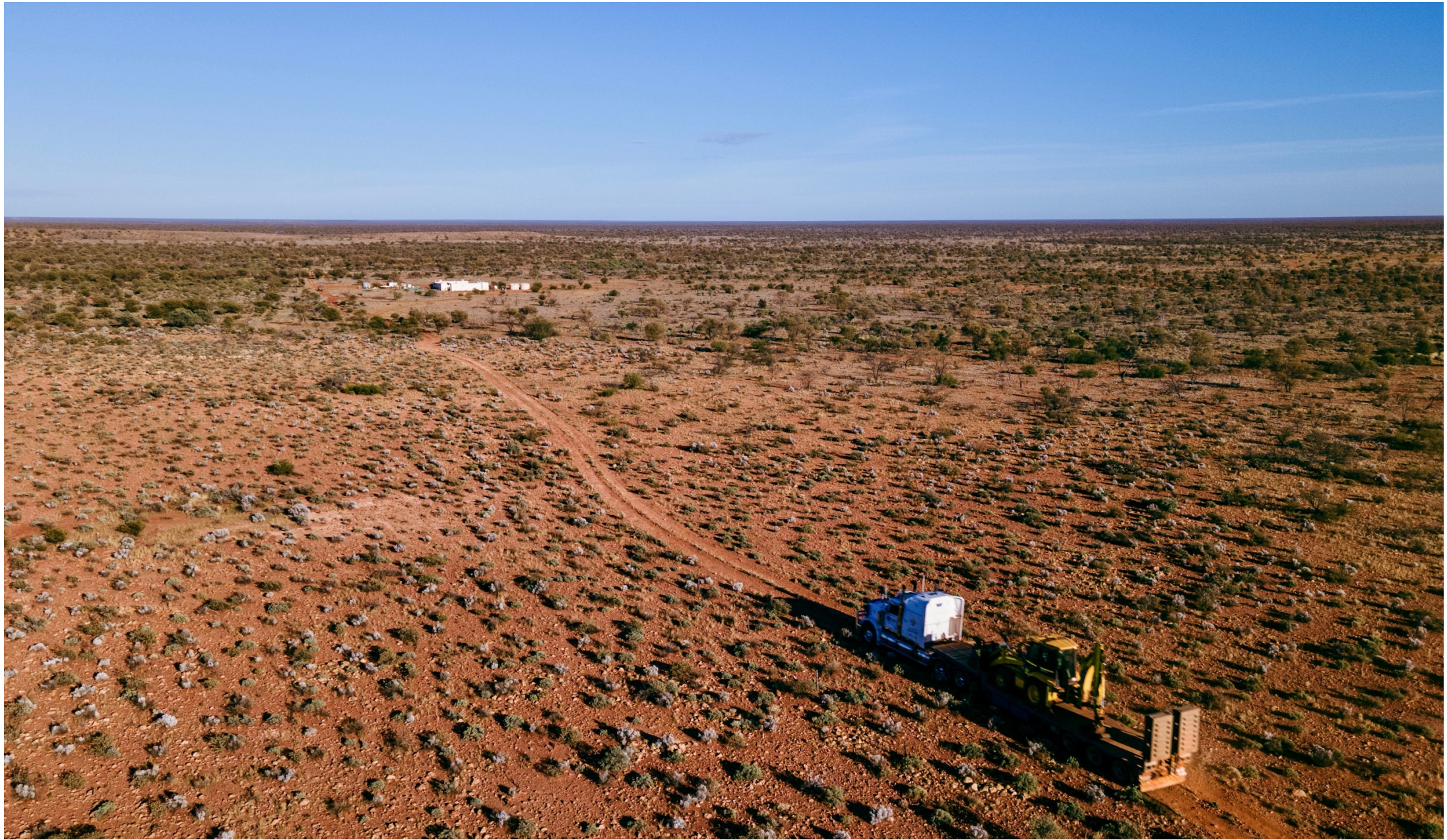
Fig 1: Newly acquired earth moving equipment arriving into Aurora Tank after 3,500km trip from Perth