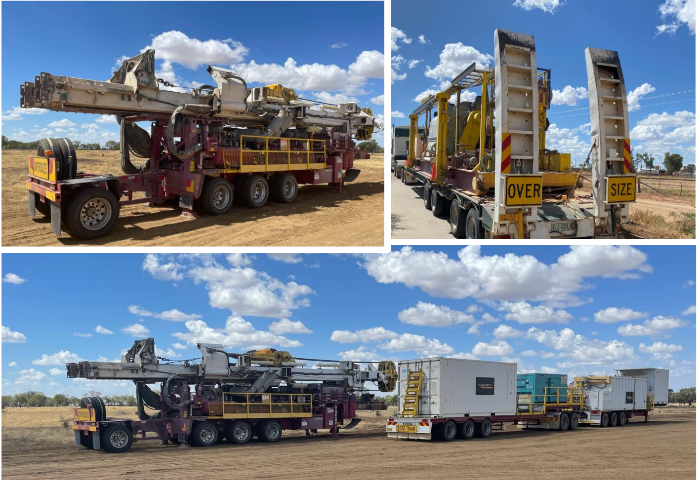
Figure 2 – Drilling rig arriving following wash-down

The Silver City Rig 23 has arrived on-site following being washed down to remove weeds and seeds (Figure 2). This rig is a 760 HP rig with 200 klbs pull back. It is the sister rig of Silver City Rig 25 which was successfully used in the 2020 drilling programme. The rig is the process of being set up on the first well, G24 and is expected to spud on 20 April following a scheduled crew break.