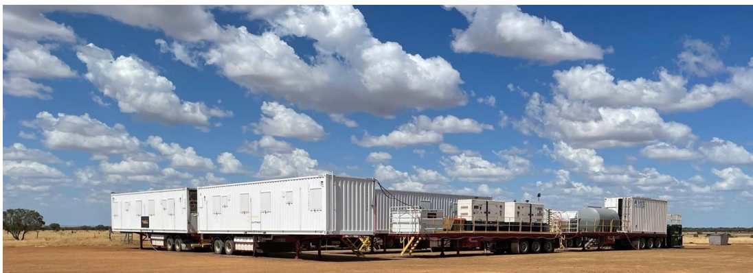
Figure 3 – Drilling and construction camp

The construction camp has been fully set-up and is ready for activities to commence (Figure 3).