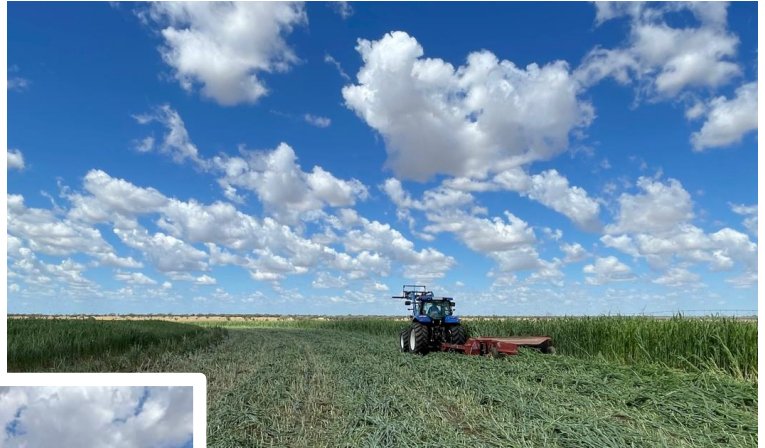
Figure 4 – sorghum crop being cut

A new sorghum crop is currently being planted within the travelling irrigator area (Figure 5).