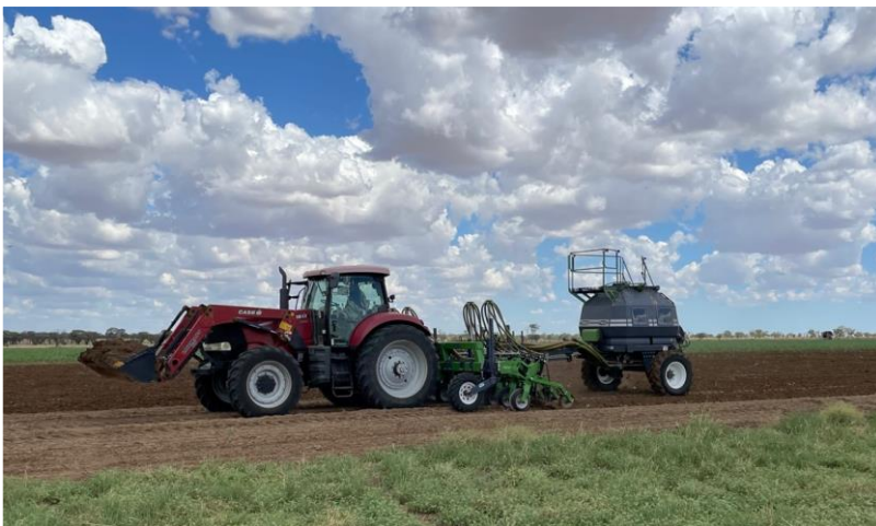
Figure 5 – sorghum crop being planted