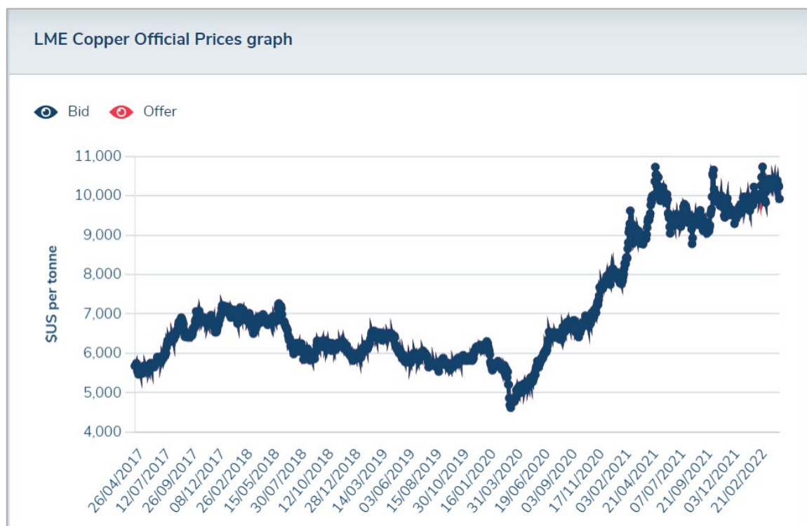
Table 8. 5 year LME Copper Cash Price