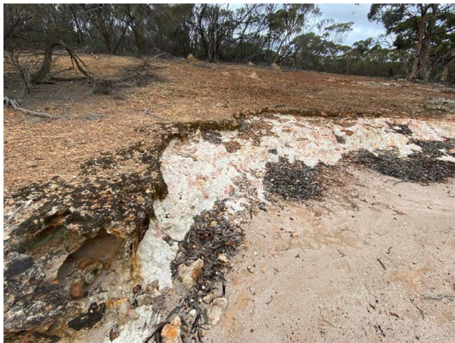
Figure 2. Burracoppin Halloysite Project – Sample RBC003 with kaolinite exposed near surface.

Local landholders covering the Company's recently granted tenements were visited as part of the reconnaissance site works.