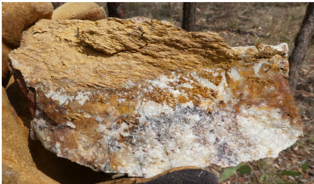
Figure 4. Granular quartz vein with boxworks after pyrite from the Origin prospect. Schistose wall-rock is tonalite with intense quartz-sericite-pyrite alteration.