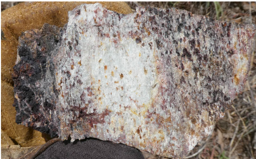
Figure 3. Quartz-sericite-pyrite altered lode from the Windmill East prospect. (Note similarity to the Dinner Creek lode).

The Windmill East and Origin Prospects present significant potential to add substantial ore to the Steam Engine Resource.