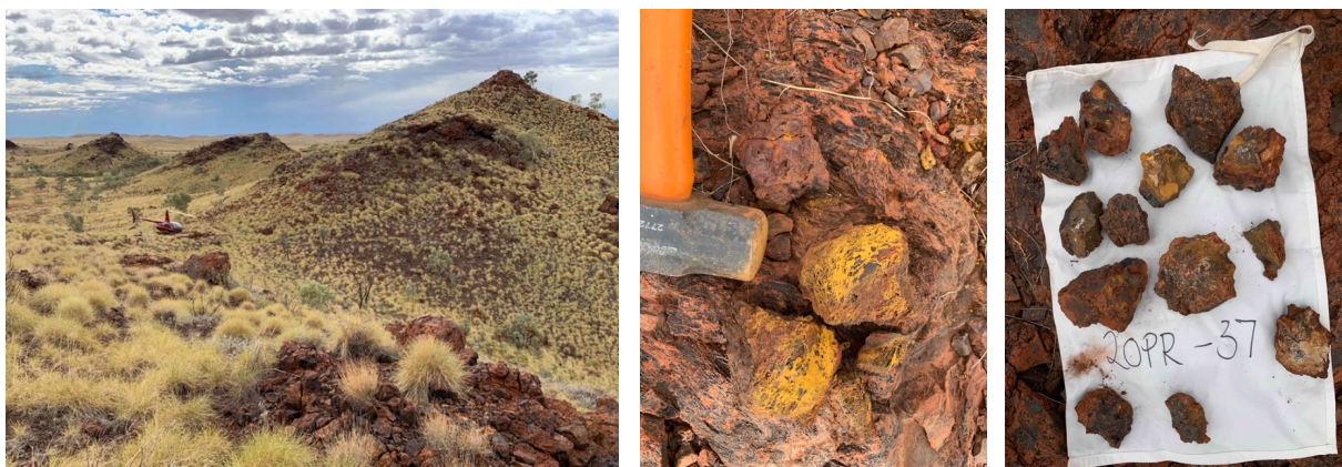
Figure 2: Samples and sample site

Observations of the sampled gossan included; colloform textures, spongy leached jarasitic/limonitic rock, massive ironstone, silcrete capping and manganese staining. No preserved primary textures or structures were observed within the gossan.