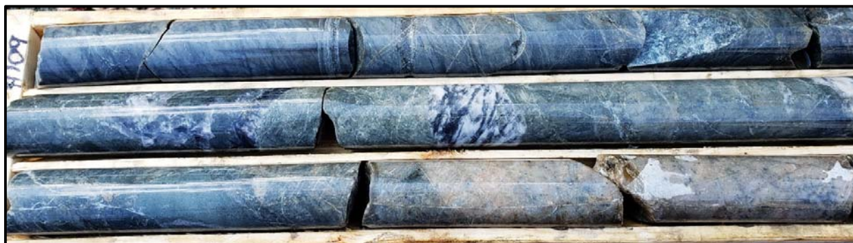
Figure 2: The visible gold at 462m is reported from the quartz-chlorite vein in the centre of the middle stick of core. Note the overall alteration and intense milky quartz / silica alteration bottom right of the core tray.

The decision to deepen hole CM-20-02 was to further evaluate the footwall basalts following the intersection of the 8m breccia zone logged from ~360m downhole to end of hole in CM-20-01 and test for additional potential mineralisation in the mine footwall. Due to intermittent zones of alteration and silicification in the footwall rocks (including the zone intense alteration at ~462m containing the visible gold), the hole was extended to a final depth of 513m. Further comments on the Target Zone and the new alteration zone will be made once the detail logs and core photographs are received.