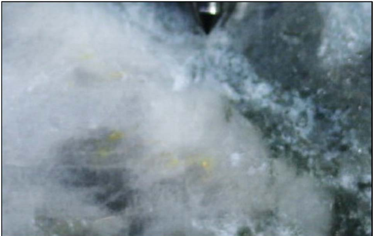
Figure 1: Very fine grained gold on vein margin at ~462m downhole. Note the scribe point for scale.