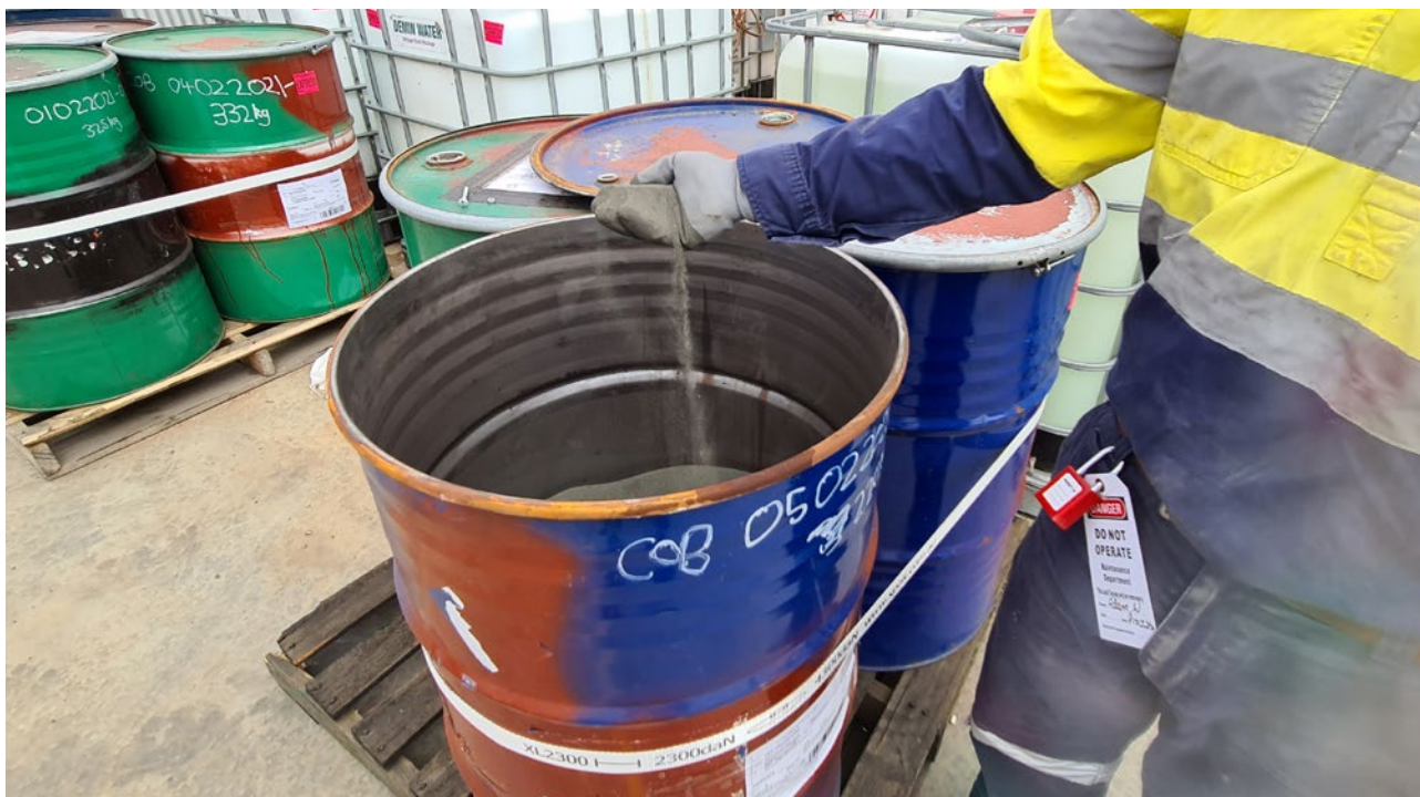
Figure 5 – Calcine received at Broken Hill

Product Recovery – the Pilot Plant recovery circuits will be operated in conjunction with the leach circuit. Existing Mixed-Hydroxide Precipitate (MHP) from laboratory testwork at ALS Perth is being used to commission the cobalt sulphate refinery.