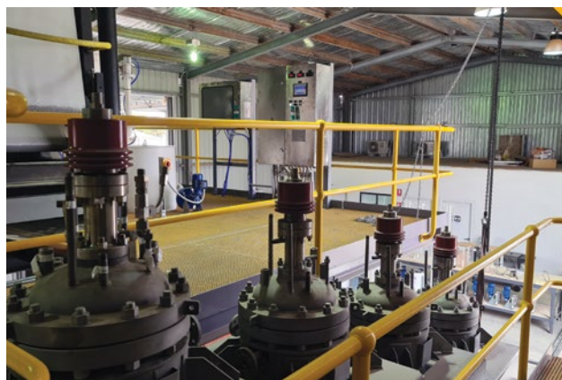
Figure 6 – Leach circuit – trials to begin shortly