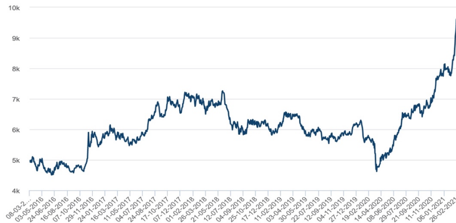
Graph 01 – 5-year Copper Price, Source: London Metals Exchange