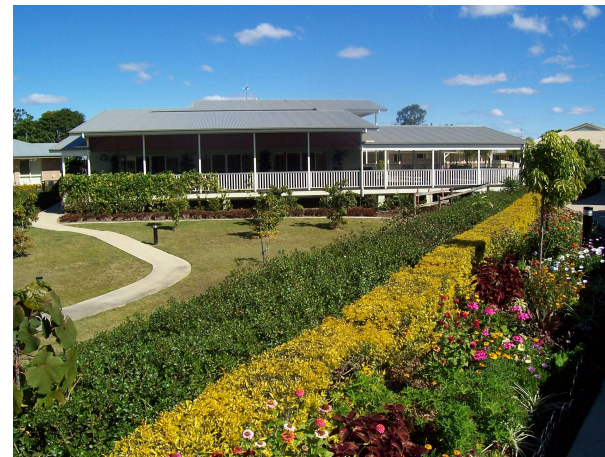
Liberty Villas, Bundaberg, Qld