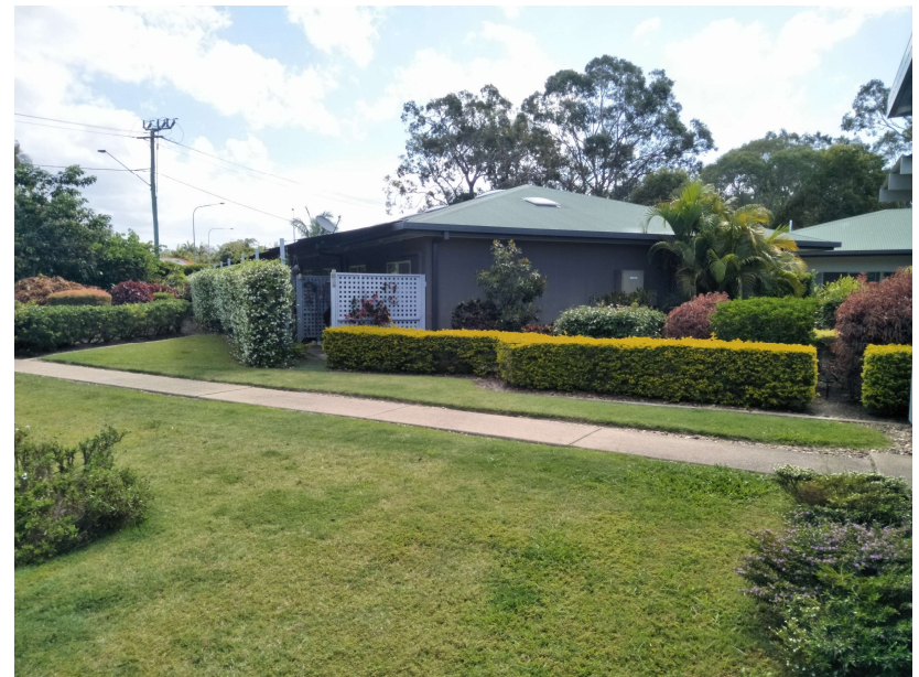
Hervey Bay, Qld