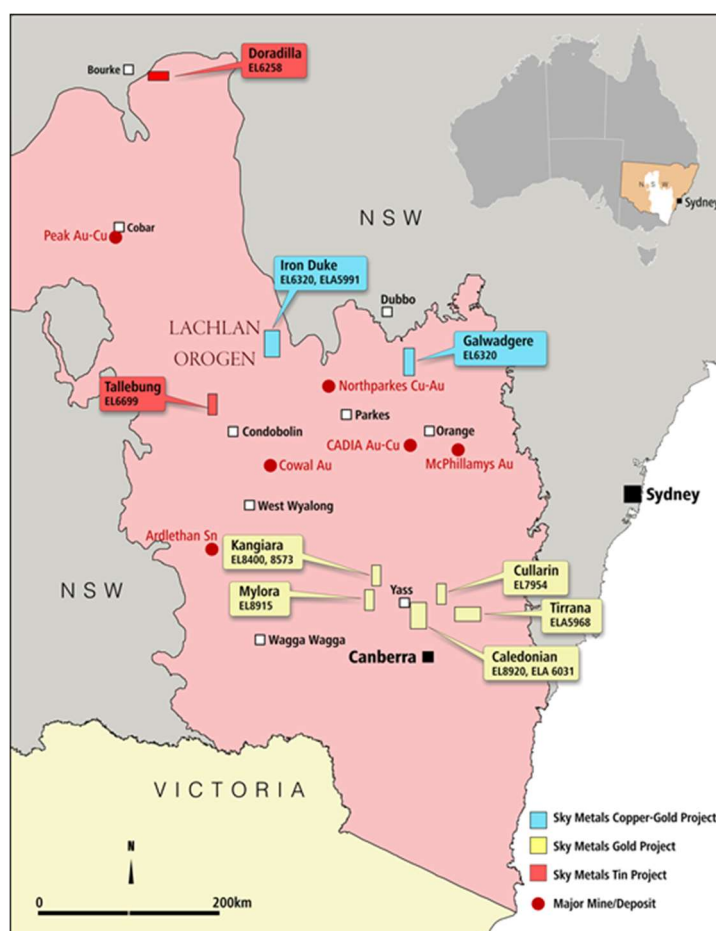
Figure 4: SKY Location Map

The Doradilla Project is located ~ 30km south of Bourke in north-western NSW and represents a large and strategic tin project with excellent potential for associated polymetallic mineralisation (tin, tungsten, copper, bismuth, indium, nickel, cobalt, gold).