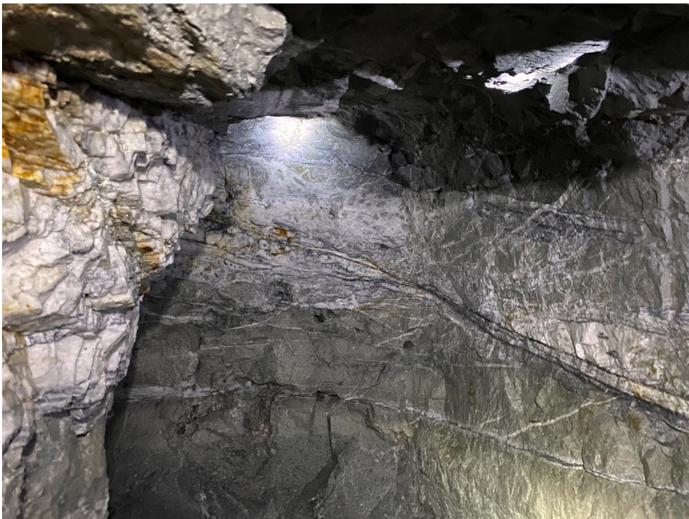
Figure (1): Development rise 8 Level McNally showing rich vein development of the down-dip plunge of McNally Reef.

The quarter was largely focused on expanding mining operations with the commencement of development works from 8 Level to 7 Level, in order to substantially increase production volumes from McNally Reef (refer AuStar Gold ASX release Morning Star Production and Geology Update 19 August 2020). As at time of writing, these development rises are progressing across three headings, predominantly through auriferous quartz-rich material largely crediting production inventory, with the most advanced of the rises approximately 12 metres from breakthrough to McNally Reef.