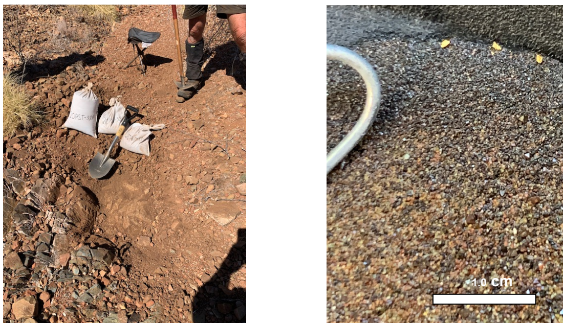
Figure 2: a) Collection of stream sediments b) 20PST20 54 showing visible gold in pan

The anticipated aeromagnetic data may assist with further delineation of the NE cross cutting structures which may be critical to gold mineralization.