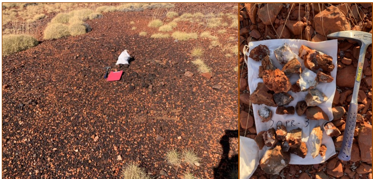
Figure 3: Rock Chip Sample site and sample selection