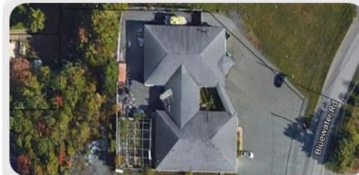
BTS - Bedford, Nova Scotia, CANADA

177 Bluewater Road, Bedford, NS B4B 1H1, Canada