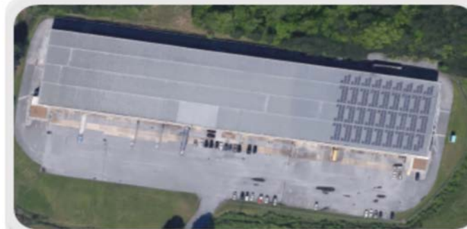
PUREgraphite - Chattanooga, Tennessee, USA

177 Bluewater Road, Bedford, NS B4B 1H1, Canada