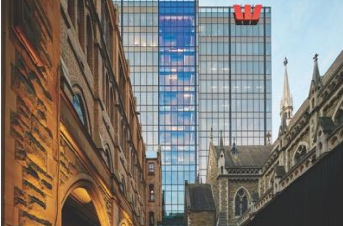
150 Collins Street