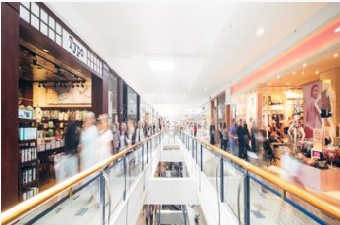
Highpoint Shopping Centre