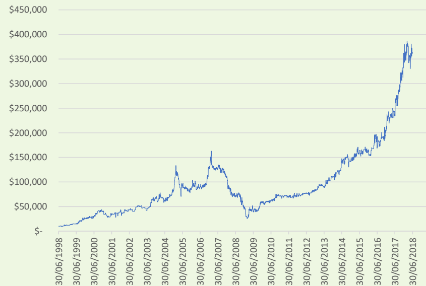
TOTAL SHAREHOLDER RETURN SINCE 30 JUNE 1998

1. Based on $10,000 as at 30 June 1998 with all dividends reinvested into CVC shares results in an investment value of $362,874 as at 30 June 2018.