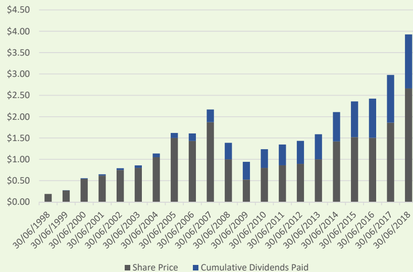
TOTAL SHAREHOLDER RETURN SINCE 30 JUNE 1998