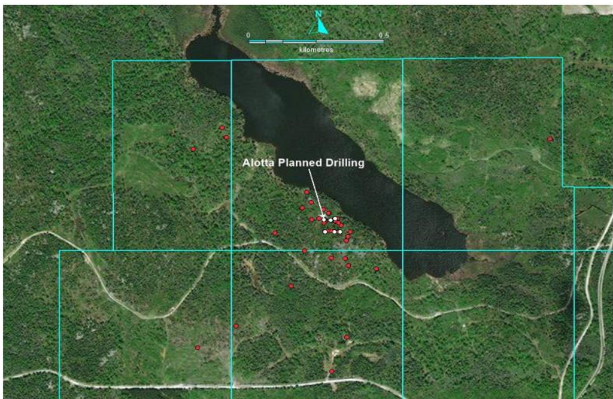
Figure 2: Alotta Mineralisation – Planned Drill Hole Locations