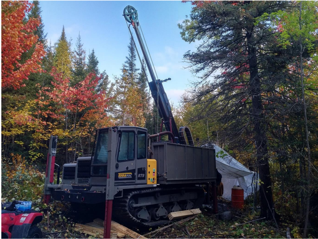
Figure 1: Diamond Drill Rig Commencing Drilling at Alotta