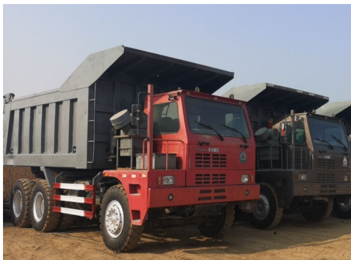
Low intensity magnetic separators and haul trucks purchased for the project