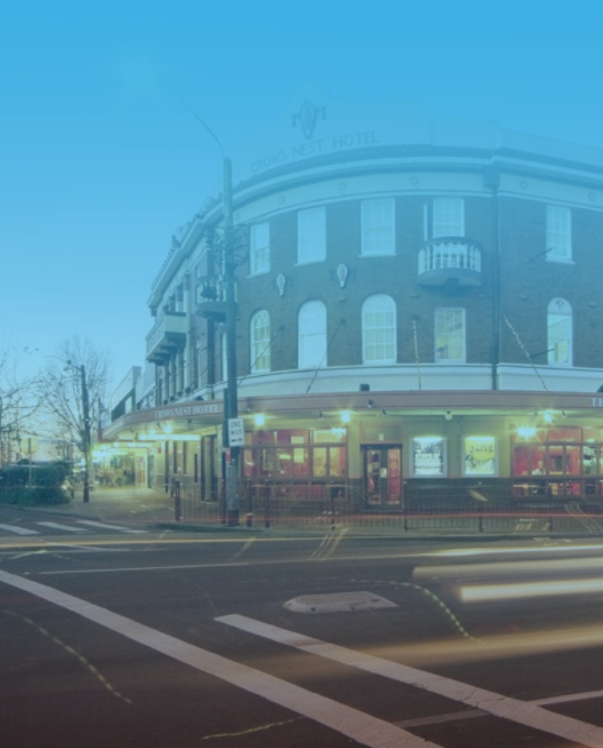
CROWS NEST HOTEL, SYDNEY NSW

ALE's Board encourages securityholders to consider all aspects of the portfolio's value.