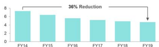
Net Debt Profile FY14 to FY19 ($B)

The Group's Financial Framework targets an optimal capital structure. This results in a Net Debt target range of $5.2 billion to $6.5 billion, based on the current Average Invested Capital of approximately $8.9 billion, a minimum ROIC of 10 per cent and net debt/ROIC EBITDA range of 2.0-2.5 times. This capital structure optimises the Group's cost of capital and preserves financial strength with the objective of enhancing long-term shareholder value. At 30 June 2019, Net Debt was $4.7 billion which is below the bottom of the Net Debt target range. The Group's optimal capital structure is consistent with investment grade credit metrics. The Group is rated Baa2 with Moody's Investor Services.