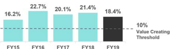
Return on Invested Capital

Return on Invested Capital (ROIC) of 18.4 per cent was above the Group's value-creating threshold ROIC of 10 per cent for the fifth consecutive year.