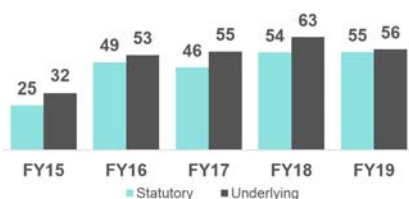
Earnings Per Share (Cents)

Statutory Earnings Per Share was 54.6 cents, flat on the prior year as the decrease in Statutory Profit After Tax was offset by a seven per cent reduction in weighted average shares on issue. The Group purchased 113 million shares for $637 million at an average price of $5.63.