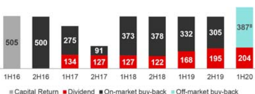
Track Record of Delivering Shareholder Returns ($M)

The Qantas Group takes a disciplined approach to allocating capital with the aim to grow Invested Capital and return surplus capital to shareholders.