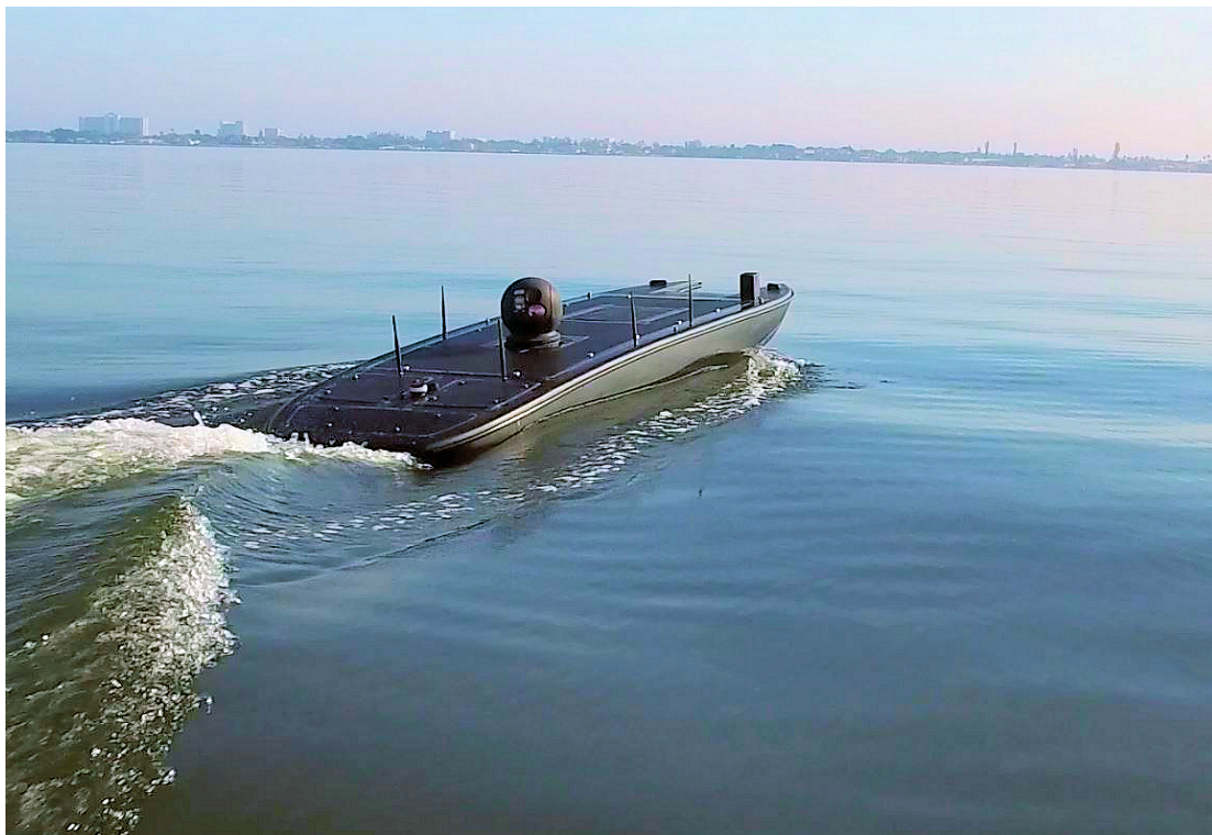
MANTAS T12 heading out on an Intelligence, Surveillance, and Reconnaissance (ISR) mission