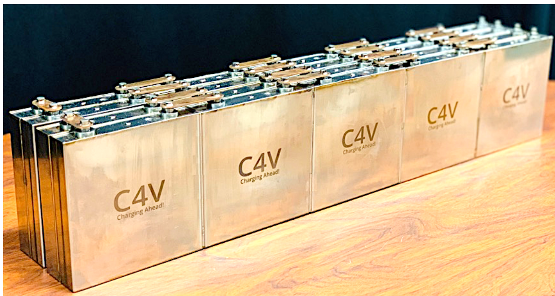
Battery pack designed for MARTAC by C4V team for Autonomous vehicle applications.