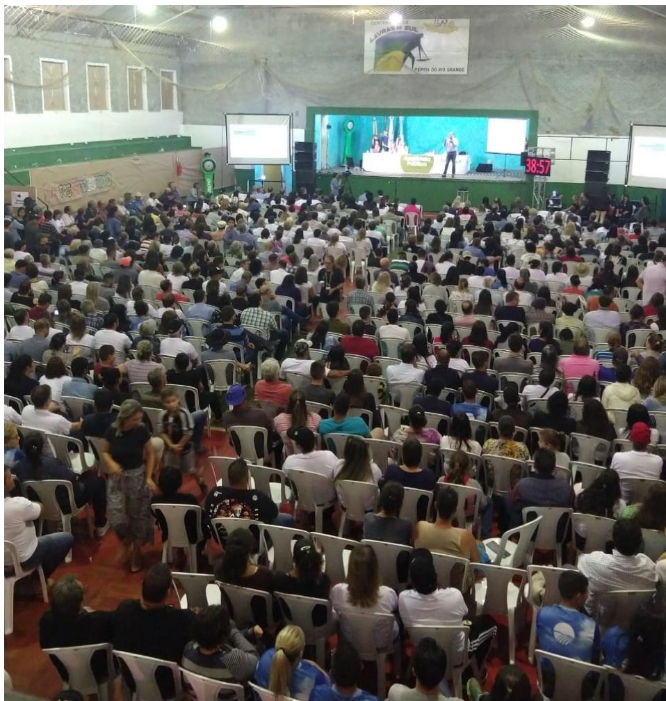
The auditorium in Lavras do Sul was at full capacity with participants from the local community expressing strong support for the Três Estradas Phosphate Project

Agua has now completed all requirements to obtain the environmental permit (called the “Preliminary License” or “LP” in Brazil). FEPAM will consider the results of the event and will have 30 days to consider any further comments and advise if any further follow up items are required from Agua. Approval of the LP will be a major milestone for the Company. The next phase of development will be obtaining the Installation Permit or “LI”. The LI requires implementation of the programs and requirements prescribed in the LP to ensure Três Estradas has a minimal impact on the environment and social wellbeing of the community. During this time, Agua will be finalizing the design and plans for the project site, negotiating offtake contracts and sourcing debt for construction. The LI is expected to take up to 12 months to obtain after which construction can commence.