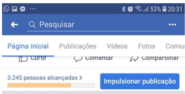
Left: The hearing was also streamed live on Facebook, with about 2,000 people following the proceedings online