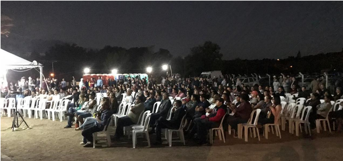
Above: Overflow attendees were accommodated outside the auditorium watching the proceedings via projection on big screens