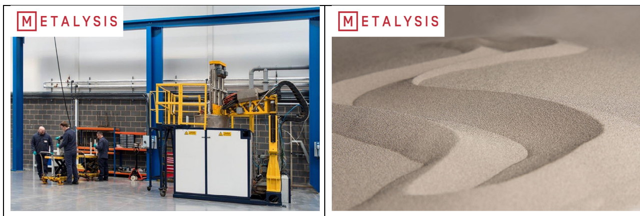
Figure 2: Metalysis' R&D scale production facility and metal powder produced using its innovative, solid state production process