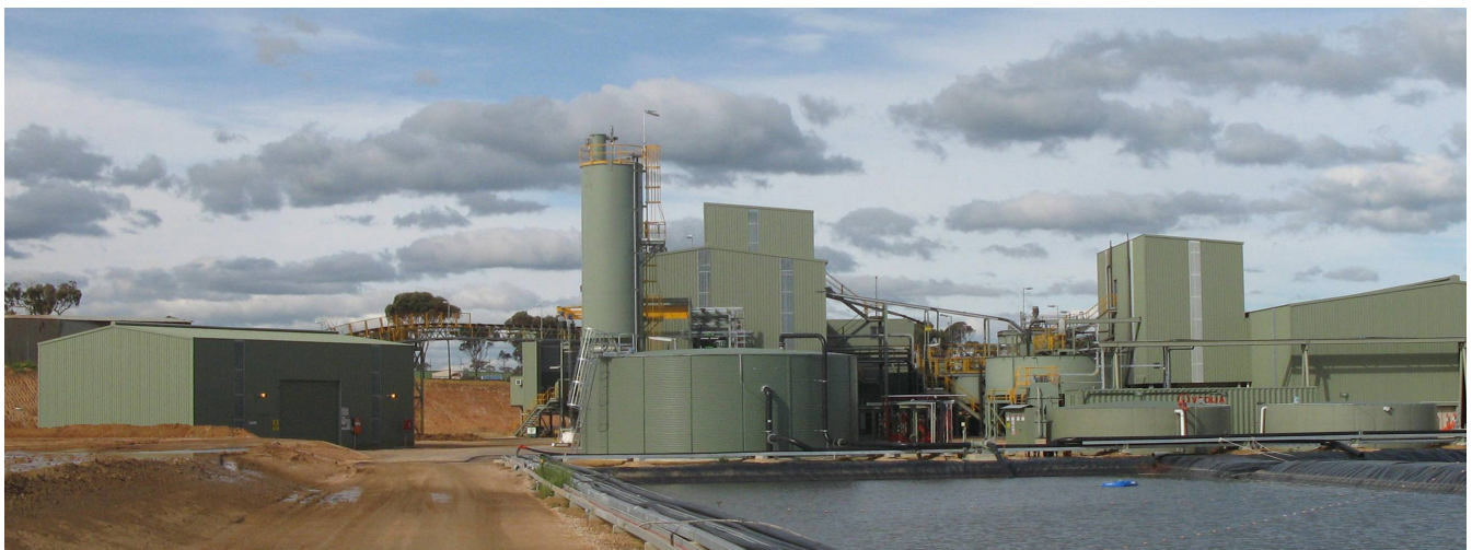
Angas Zinc Mine Plant

During the quarter the cash expenditure on the project was $169,222.