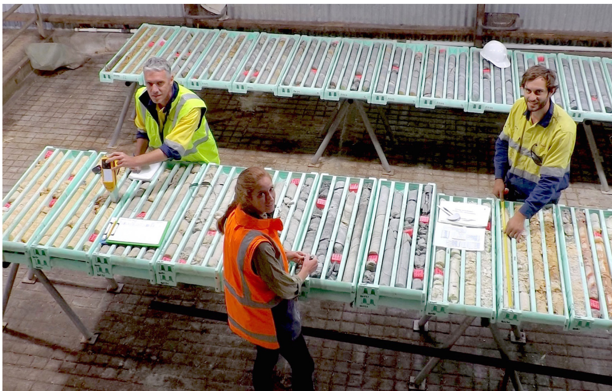
Bird-in-Hand gold core samples

During the quarter the cash expenditure on the project was $284,893.