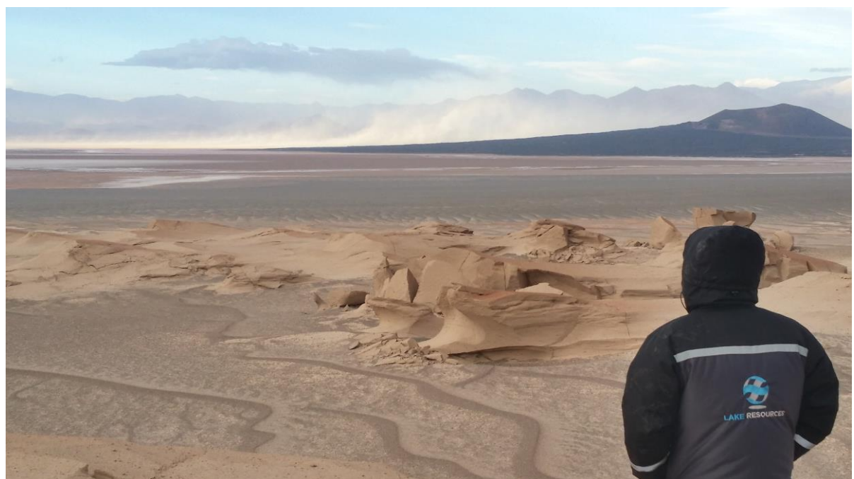
Figure 3. Kachi Lithium Project, with images of the rotary drill rig and the diamond rig in the south east side-by-side; the rotary rig at K03 ready to drill deeper; a view of the salt lake from the south west looking north