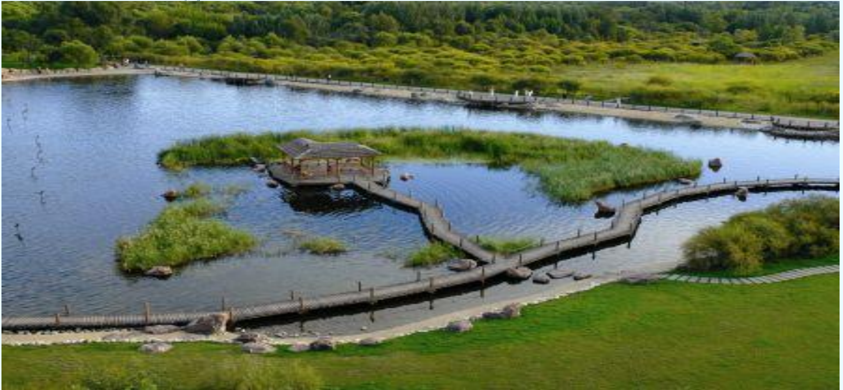
Photo of a constructed Wetland site as an example of what a finished wetland project may look like.

Providing zeolite; other materials & engineering services