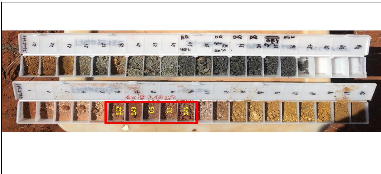
Figure 3: RC Chip tray for Hole 031 highlighting elevated gold values near surface

Diamond drilling is planned to test the area around hole 031 to confirm the existence of a repeat high grade pipe like structure similar to that discovered by hole 020 as announced on 1 November 2017. This work will be planned for the first half of 2018 following the diamond drilling program (mid November 2017) near hole 020.