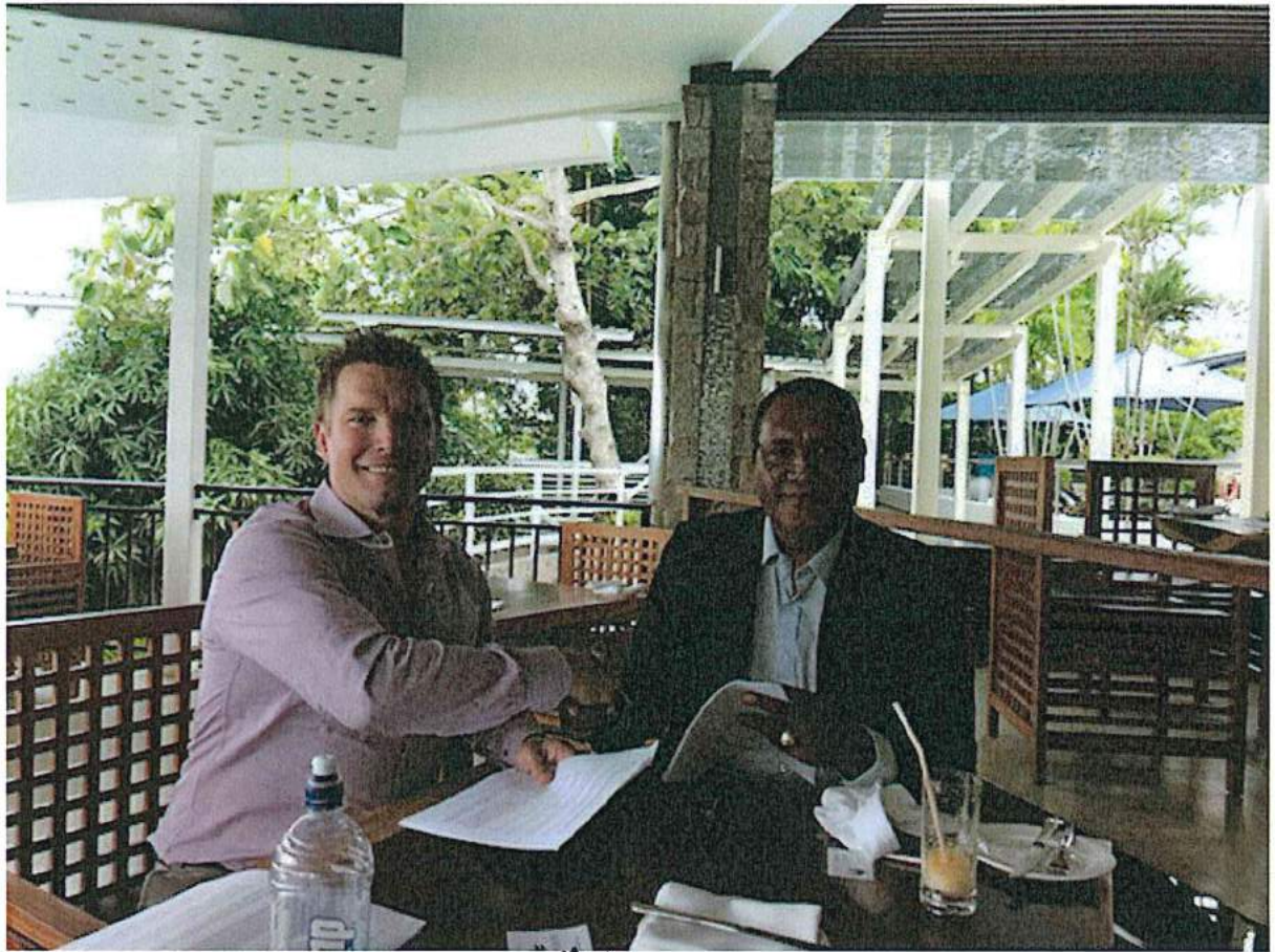
Signing of MOA, December 2017