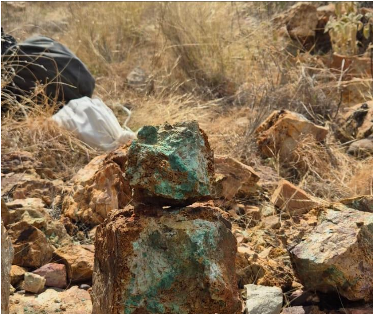
Figure 2 – Quartz-malachite mineralization at the Patmungala copper prospect.