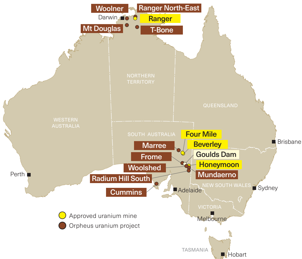
Figure 3 Location map of uranium assets owned by Orpheus located in South Australia and Northern Territory.