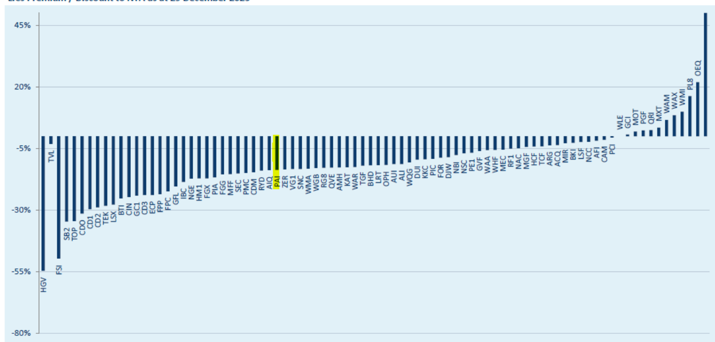
LICs Premium / Discount to NTA as at 29 December 2023