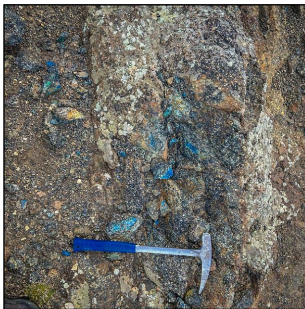
Figures 4 and 5: Outcropping Copper Oxides and Disseminated Sulphides.