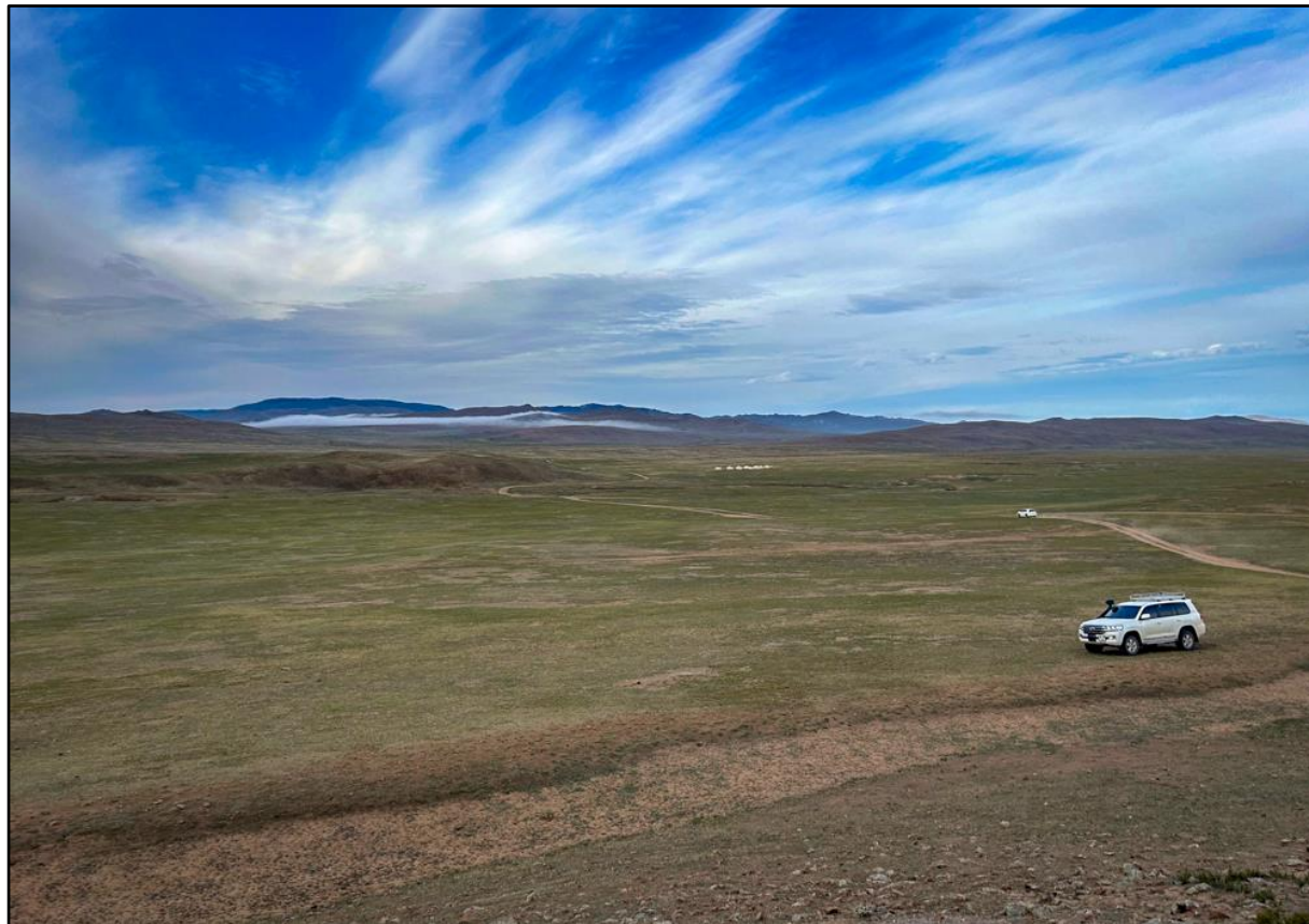
Figure 3: Sant Tolgoi terrain with exploration camp in background