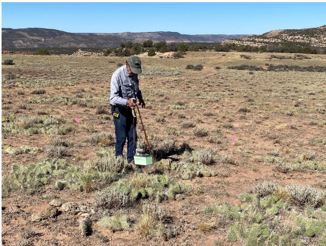
Photo 1: Collecting background Scintometer readings over proposed drill pads