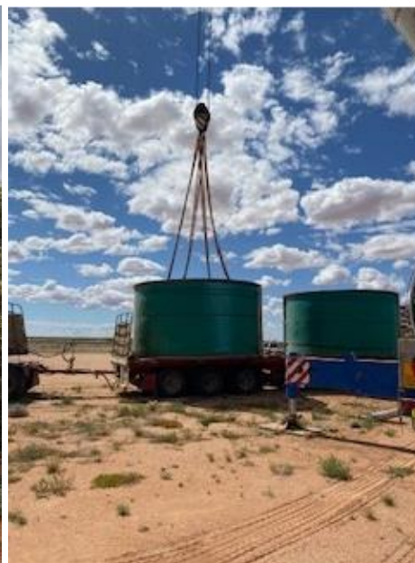
Delivery of Fiberspar pipe spools