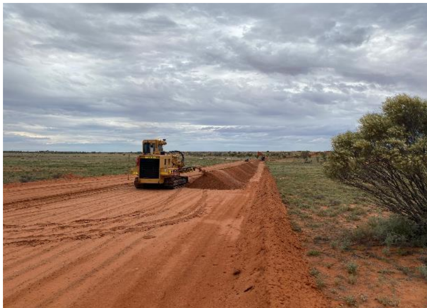
Trenching pipeline route from Vali