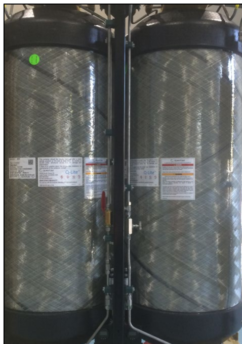
Above: Type 4 Carbon Fibre Cylinders similar to those being used in the State Gas Virtual Pipeline