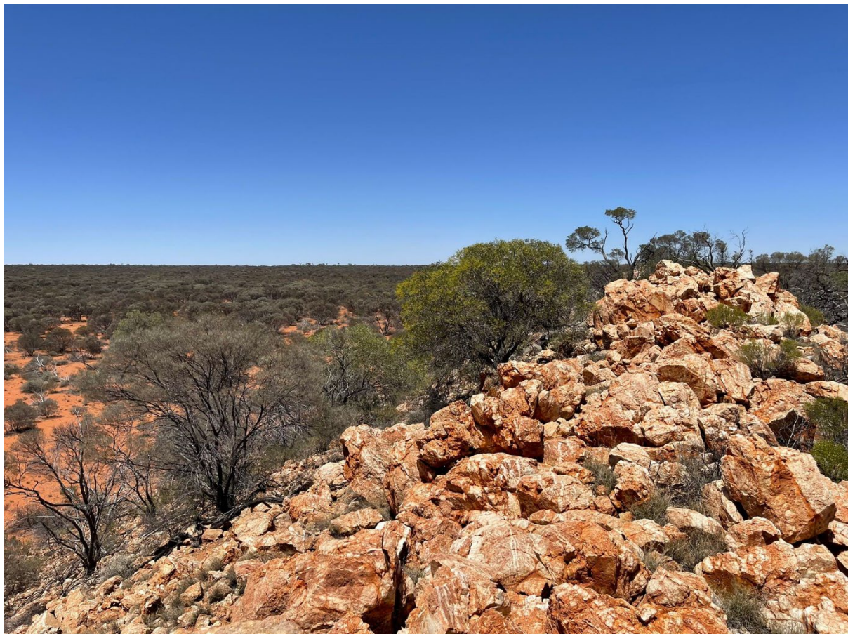
Figure 2: Outcropping pegmatites located within E53/2198, the first granted tenement