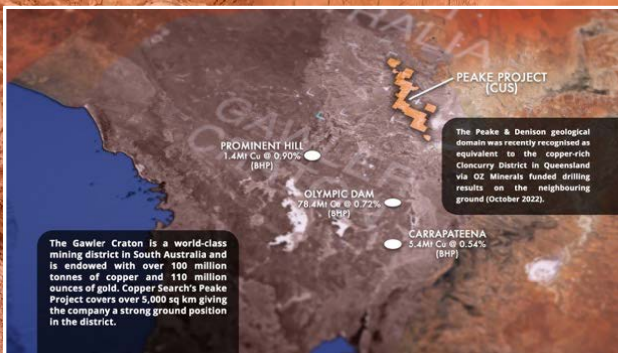
Figure 1. The Peake Project Location

OPERATION / TEX LOCATION: Gawler Craton, S.A.