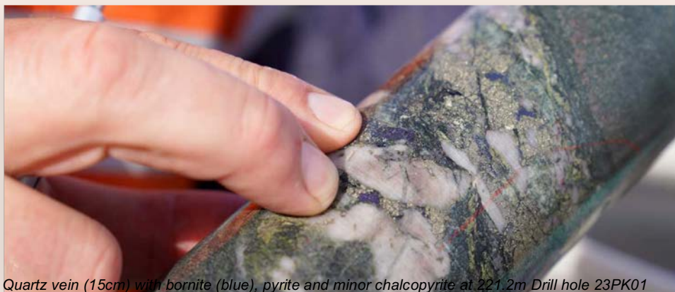
Quartz vein (15cm) with bornite (blue), pyrite and minor chalcopyrite at 221.2m Drill hole 23PK01