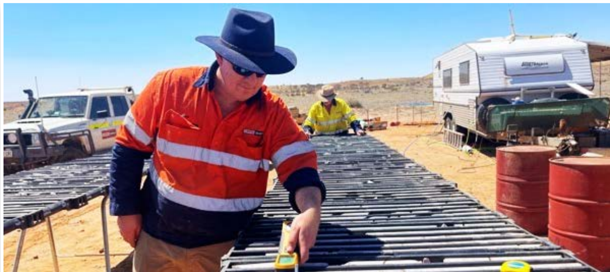
Figure 4. Logging drill core from AC02 (September 2023)