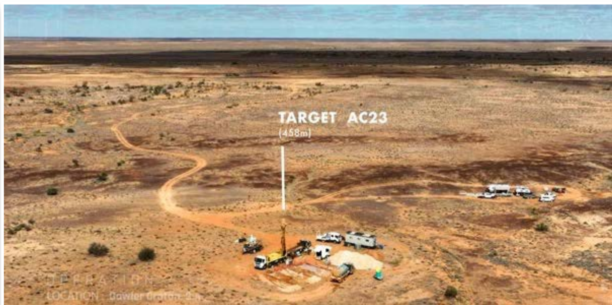
Figure 3. Drilling at Target AC23 (May 2023)

Over the September quarter, the Company tested three more targets and narrowed its exploration focus to the prospective Karari Shear Zone, which extends from the SW to the NE across the Peake Project.