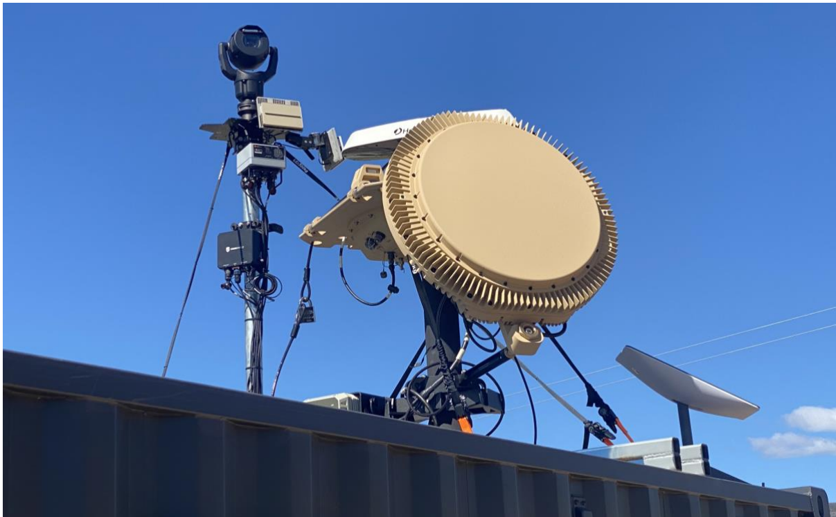
Image: Command container module deployed at DroneShield's Blue Mountains test site, including the RPS-82 radar

DroneShield radar options can be found at https://www.droneshield.com/products/radars/ .