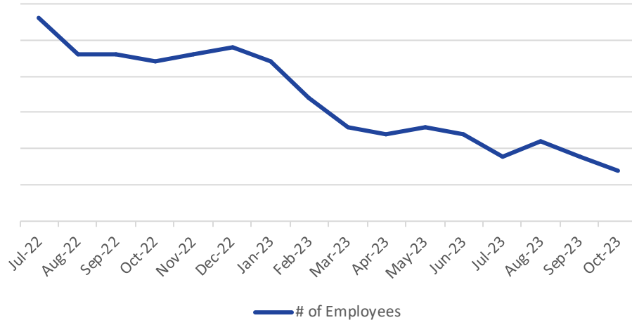
Farming Monthly Headcount