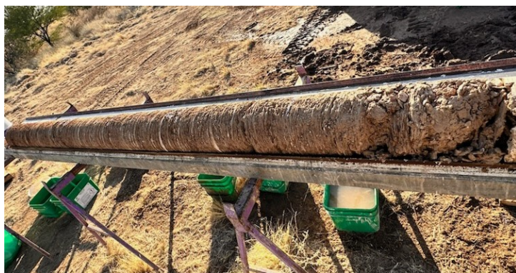
Figure 1: 8C core from 8C core trial on LIND016_B1 (twin hole)

A drilling program involving 14 x 4C and 2 x 8C core holes was planned to gather ore samples for a Pilot Scale testing program in a Vanadium Processing Pilot Plant (VPPP). Two 8C core holes were successfully drilled to provide more sample material options for the orebody and a more efficient recovery of the core.