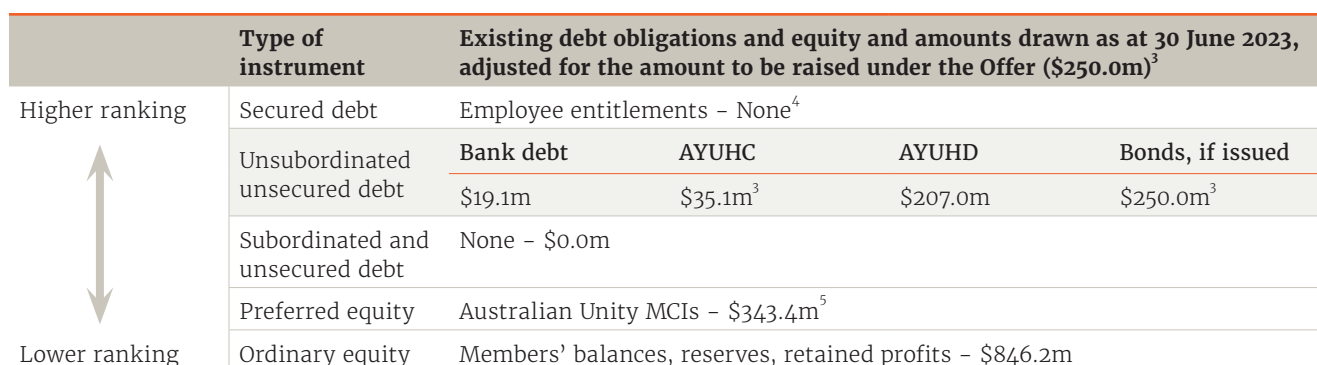
Illustration of ranking upon winding-up