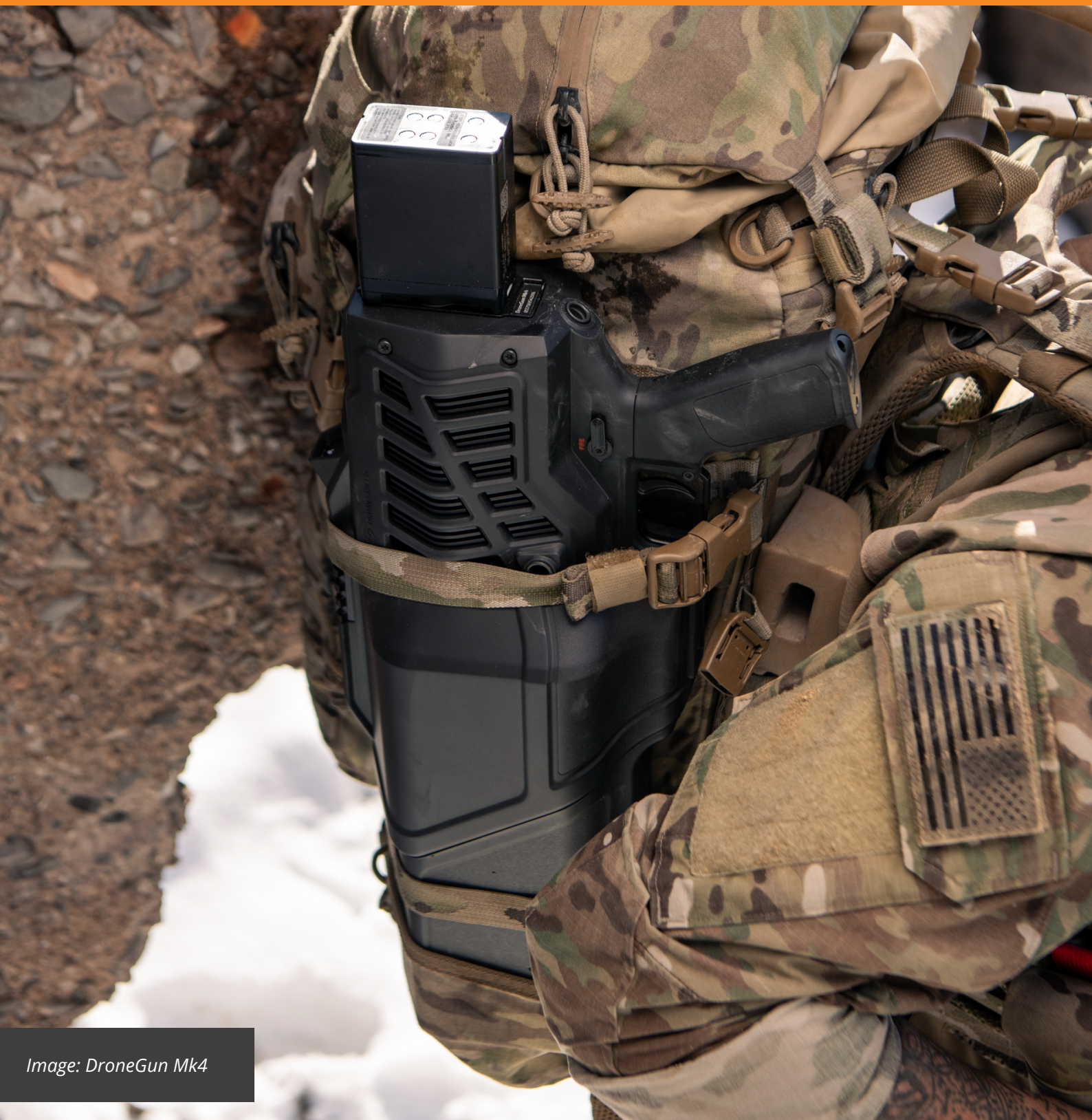
Image: DroneGun Mk4