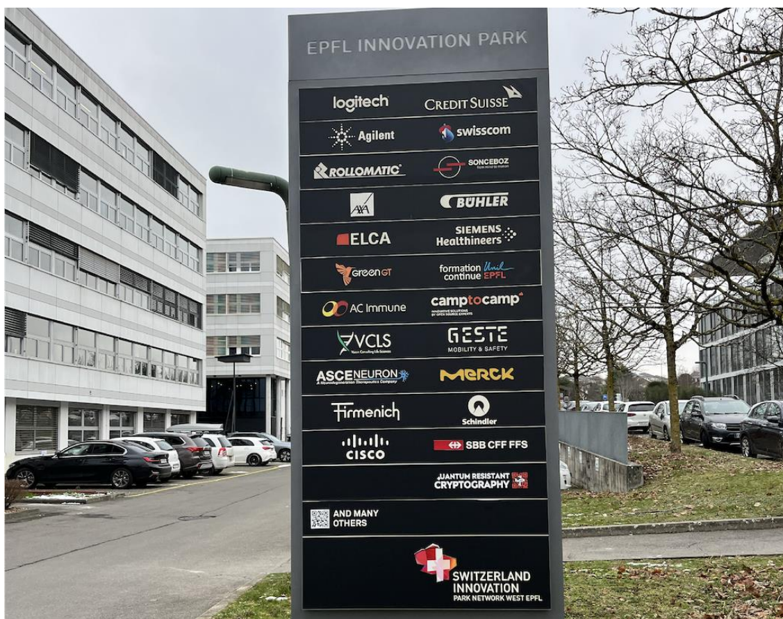
Image 4. Entryway to the EPFL Innovation Park in Lausanne, Switzerland, that is part of the SIP West EPFL network, where Archer is based as part of the AIC Program.

The AIC Program spaces are located at the six innovation parks of the SIP West EPFL network: Archer will enter the AIC Program linked to the EPFL Innovation Park (Image 4), and will be able to utilise the other innovation parks during the program. The duration of the AIC Program is six months and may be extended.