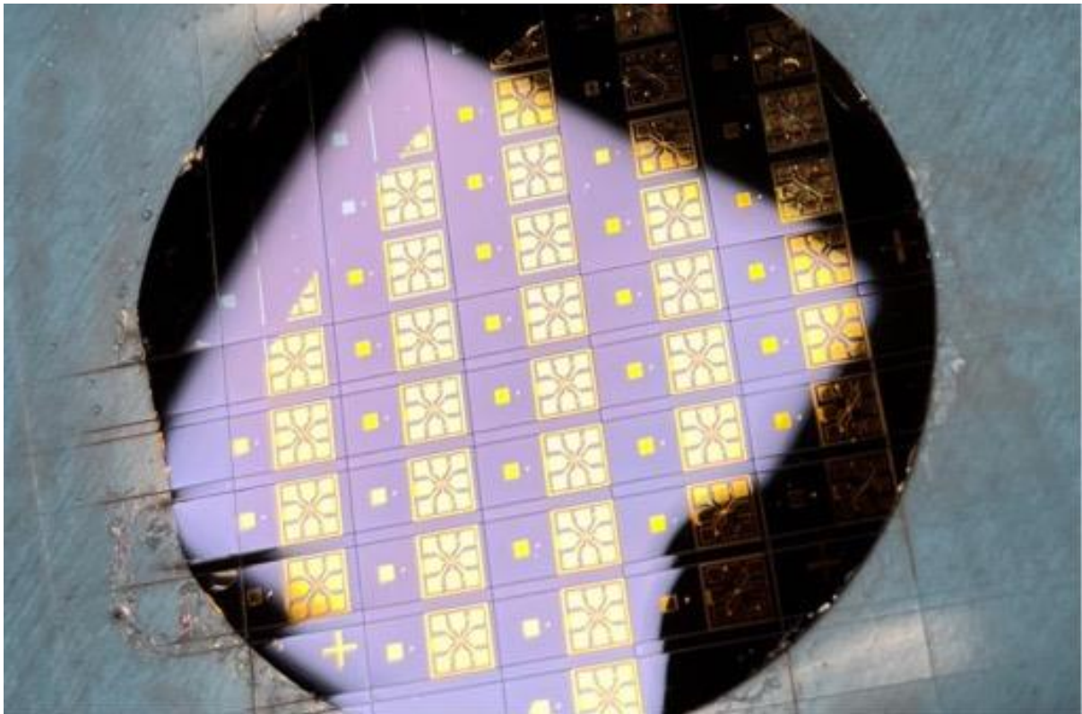
Image 1. A multitude of Archer quantum electronic devices defined by UV optical lithography on a commercial 2" silicon-on-insulator wafer substrate.