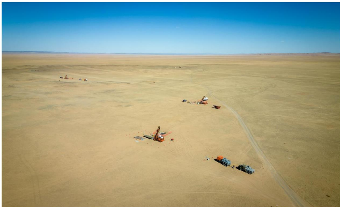
Figure 3 – Three diamond drill rigs operating at Stockwork Hill.